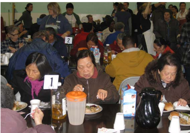
Asian American senior citizens enjoying a hot meal served by the volunteers of Father's Heart Ministries