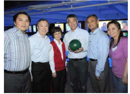
TEAM Depository Trust & Clearing Corporation