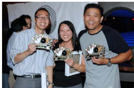
TEAM Time Warner Winners of the Highest Bowling Score