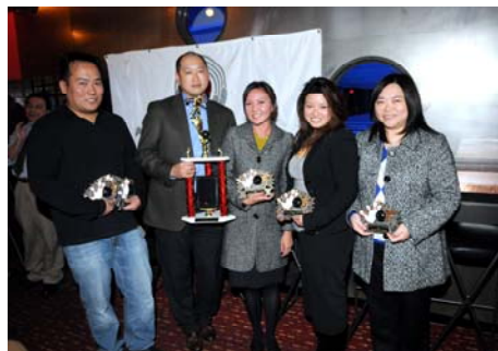
TEAM Goldman Sachs Winners of the Most Funds Raised

We would like to congratulate TEAM Time Warner Cares as the winners of the Highest Bowling Score and TEAM Goldman Sachs for the Most Funds Raised.