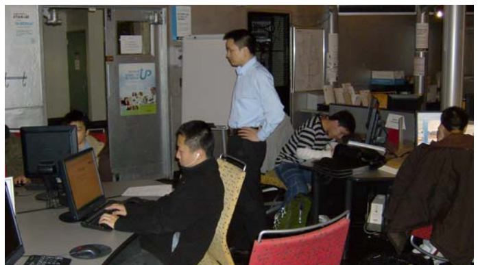
GCCA students attending computer classes

been such a success that it has expanded to over 3,000 youths all over the country in the past 7 years. The Federation hopes that this program will make a strong impact and be able to bring more Asian Americans up to speed on a technological advancing world.