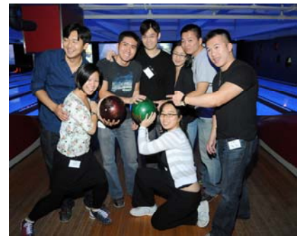
TEAM Lit Solutions