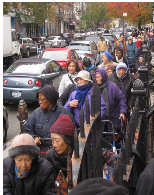
Elderly needy Asian American citizens waiting on line for a hot meal