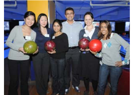
TEAM Ernst & Young