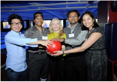
TEAM NBC Universal